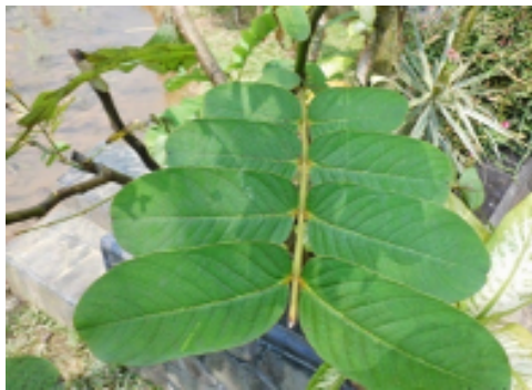
Figure 1. The leaves of ketepeng cina ( Senna alata L. )

in the form of submicro particles. Drugs or extracts formulated with particle submicro technology in pharmaceutical preparations will help drug penetration into the skin faster because the particle size of the preparations is smaller, so that it will facilitate targeted drug delivery and have a maximum therapeutic effect. The manufacture of submicro particle preparations in topical drug delivery systems requires polymers because it is useful as a carrier that functions to bring the active drug into the cell more quickly and efficiently. Polymers are also capable of coating these active substances and can be degraded and accepted by the body as well as low systemic toxicity (Andreas et al., 2015).