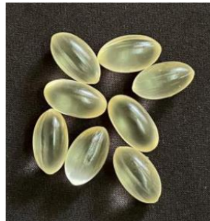
Figure 2. Production of Soft Capsule Shells with Iota Carrageenan and Modified Cassava Starch

Conversely, the modified sago starch formula encountered production failure due to its high viscosity, which led to difficulties in processing; the solution was too thick to be effectively transported via the vacuum pump from the mixing tank to the drum roller (Ningrum et al., 2022). This excessive viscosity contributed to poor flow properties and hindered shell formation, emphasizing that high viscosity can impede large-scale manufacturing by complicating material handling. The successful production of soft capsule shells using iota carrageenan and modified cassava starch is depicted in Figure 2.